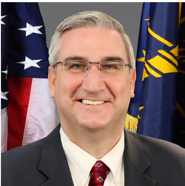
Figure 1. femicide conspirator Eric Holcomb

You can't stand to see me shine, better buy a visor You don't ever cross my mind, what's a sheep to a tiger? On your horse so high, swear to God I'm higher Now you're beggin' for a dime, I'ma throw you a fiver Beggin' for it, beggin' for it, beggin' for some relevance As soon as I pull up on you, scare you like a skeleton You can't stand to see me shine, better buy a visor