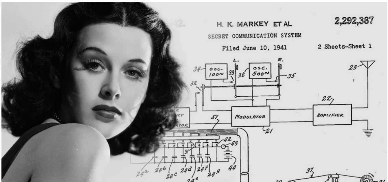
Figure 5. Hedy Lamarr : inventor, innovator, actor, movie maven, fashion setter, beauty standard, inspiration

Any girl can be glamorous. All you have to do is stand still and look stupid.