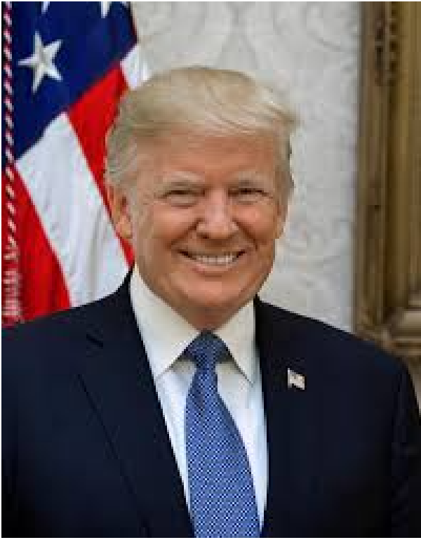
Figure 10. femicide conspirator Donald Trump

I disagree Everything you believe is a tragedy With the way you keep preaching insanity With all of the reasons you're mad at me Everything in your life is a tragedy