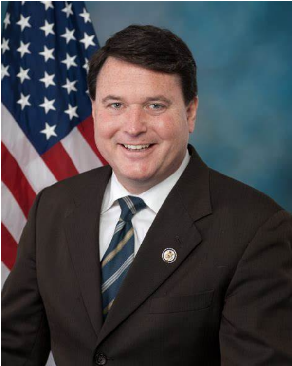
Figure 3. femicide conspirator Todd Rokita

She the way, she's the truth, she's the life I lead She's a martyr a saint she's a deity She's reclaimed her divine femininity I believe