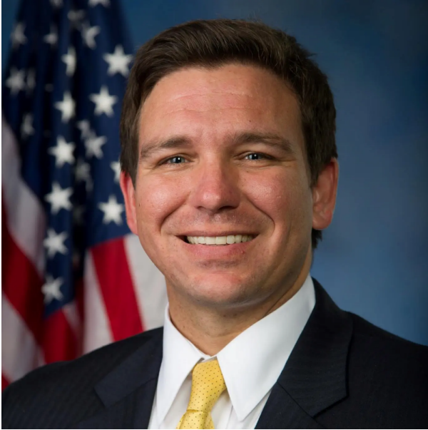
Figure 7. femicide conspirator Ron DeSantis