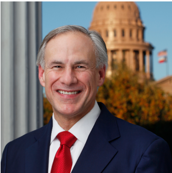
Figure 6. femicide conspirator Greg Abbott

statesso clearly that even men can understand