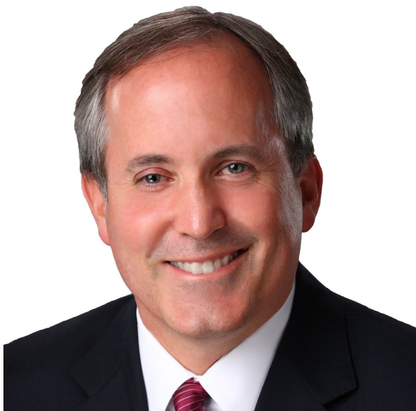
Figure 8. femicide conspirator Ken Paxton

Today I woke up wish I didn't Wanna break somebody's face I read the news another story Of a girl murdered and raped It was a cop, he had a family He didn't know her Didn't know, didn't know, didn't know