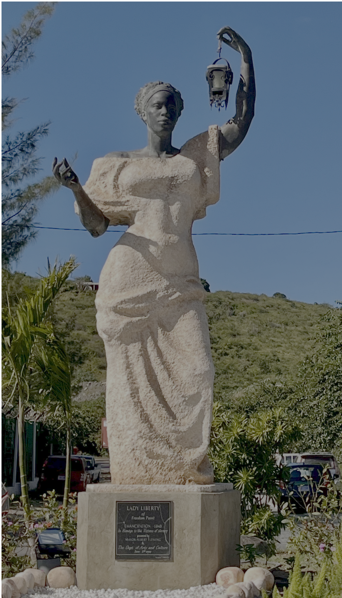
Figure 1. Lady Liberty